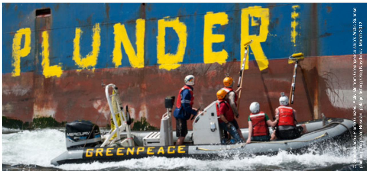
Activists from Greenpeace ship's Arctic Sunrise painting the pirate Russian pelagic fishing Oleg Naidenov, March 2012

The Russian Federal Fisheries Agency and the Managing Director of Murmanskij Trawl Fleet, however, eventually invoked the Agreement in an attempt to legitimize their vessels’ presence in Senegalese waters in 2012. 26